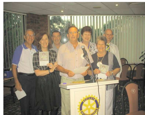
Clean up Australia Day helpers receive their certificates