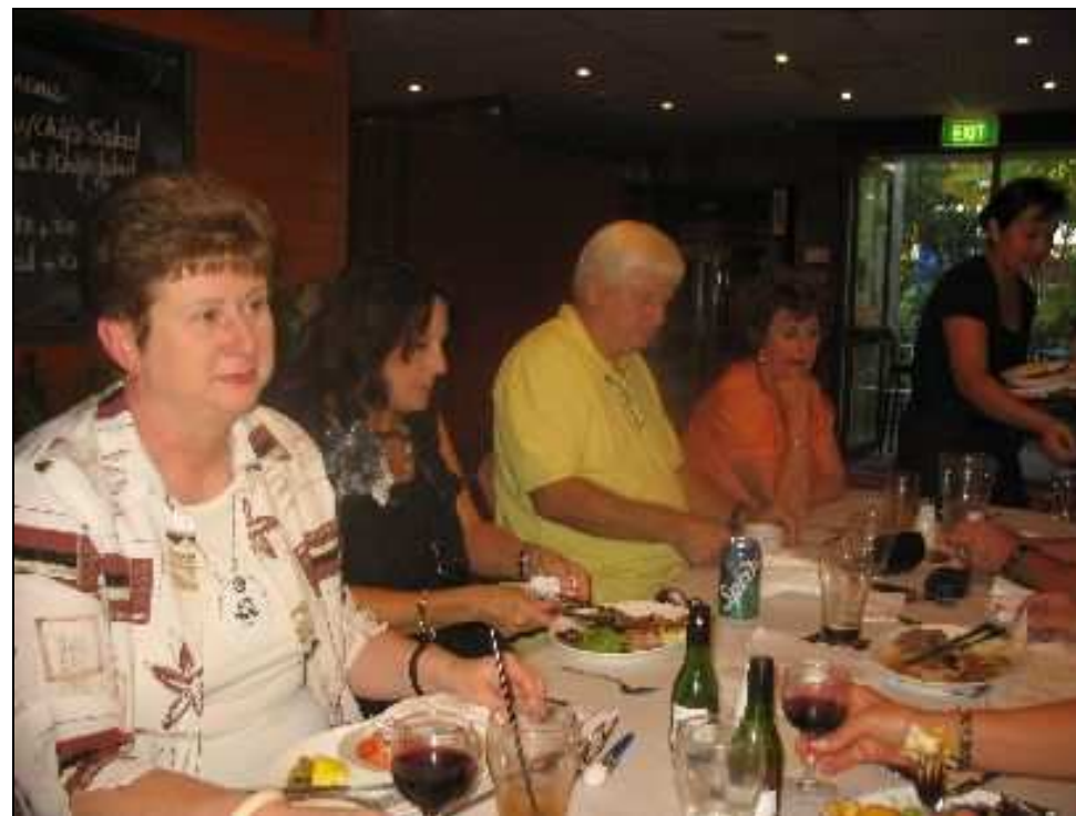
A relaxed summer meeting