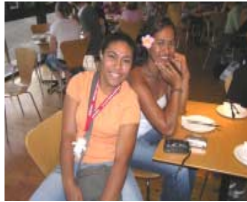
Four Pictures of our last meeting for 2005 and two pictures of the PACE students now with us.