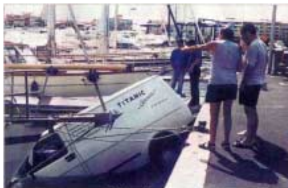
Definition of irony